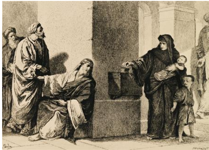
The Widow's Mite