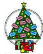
The Angel Tree

This is the final weekend to place your order for Mel's Famous Smoked Boston Butts. ST. JOHN VIANNEY COUNCIL 10010 will be taking orders after each Mass. The cost is $40 each and is payable when the order is placed. Orders will be delivered on November 21 & 22.