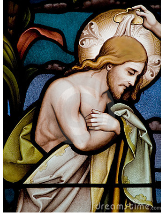
The Baptism of the Lord